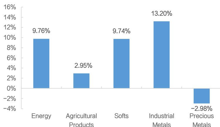
One-Month Performance by group (%)